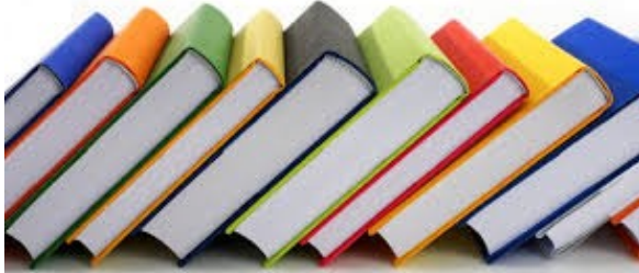
Friends of the Library Book Sale